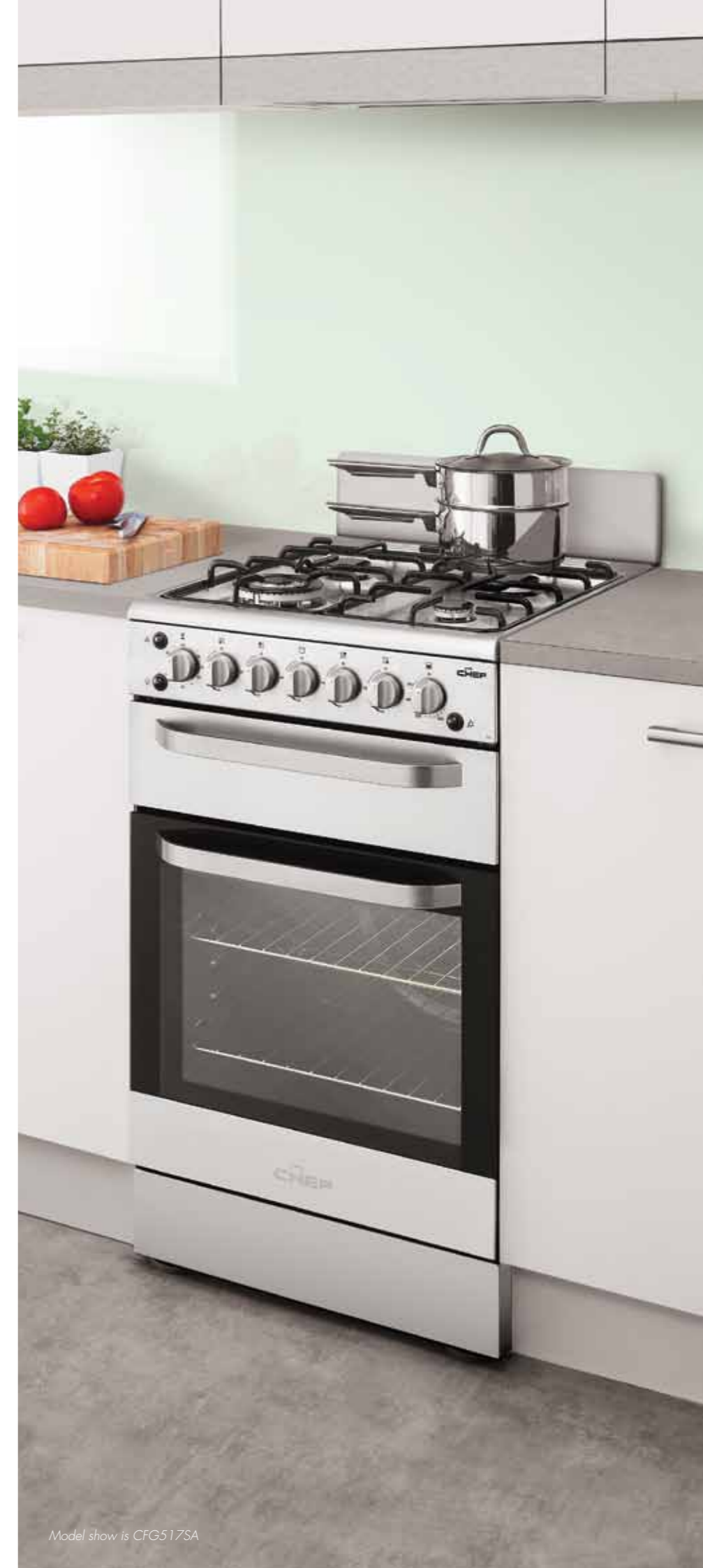
Model show is CFG517SA