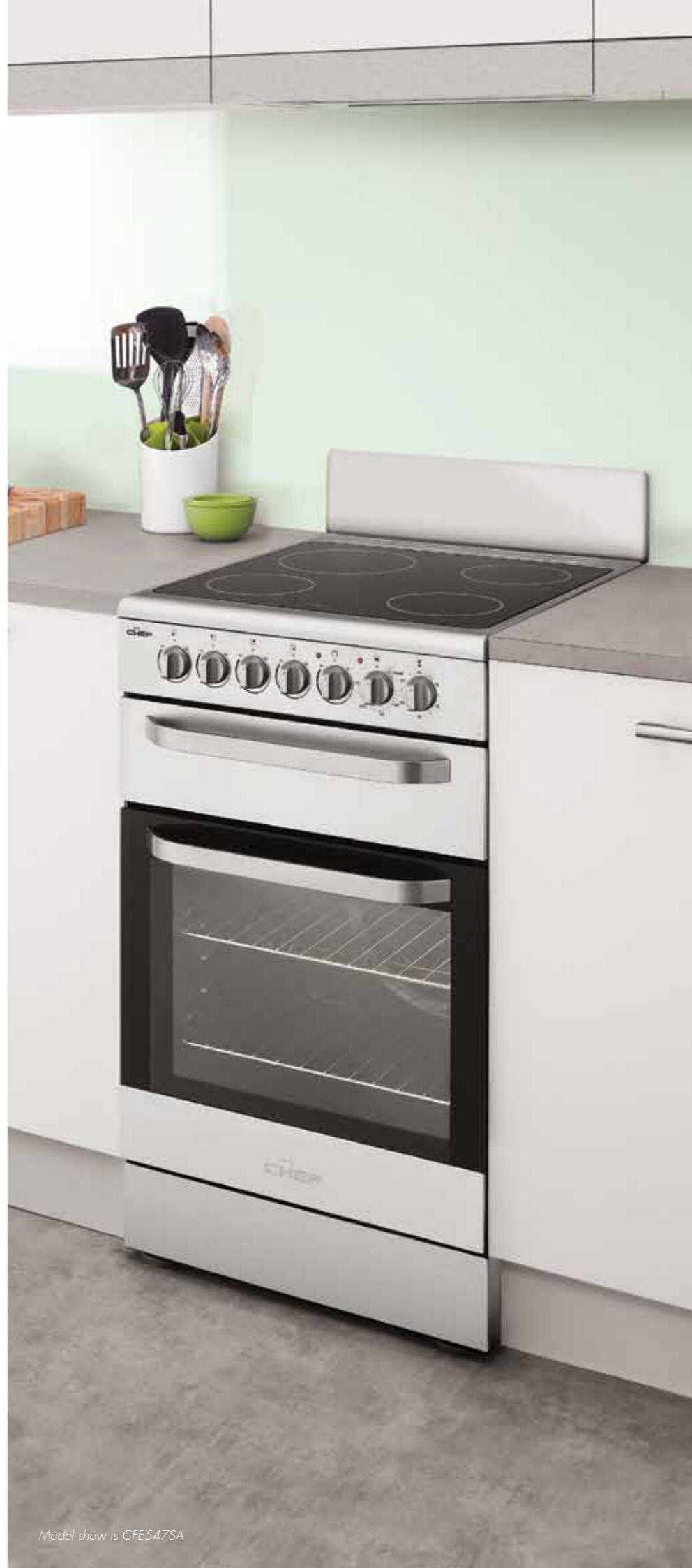
Model show is CFE547SA